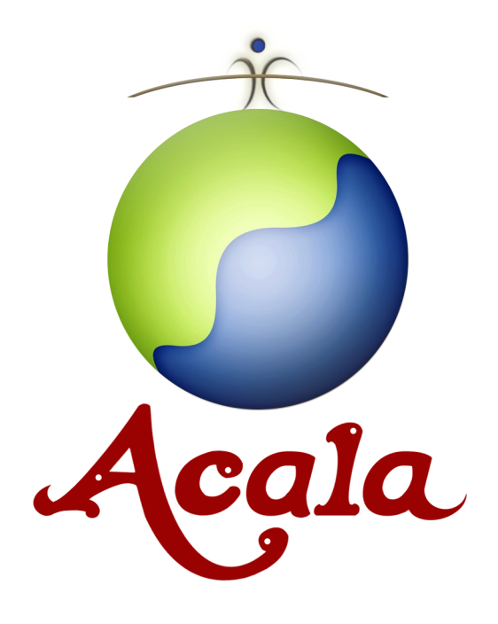
Table Water FiltersInstruction ManualFor the models Mini - Grande - Smart - Luna - Advanced